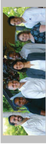
FSEA Palm Beaches Young Members 2011 Coordinators

To participate as a member, or to volunteer as a guest PE Speaker, contact fsea.pb.ym@gmail.com .