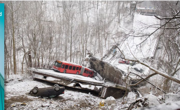
Left stranded after the Fern Hollow Bridge collapsed in January 2022 in Pittsburgh, Pennsylvania. The collapse of the bridge is a stark reminder of the country's poor state of infrastructure maintenance, a report from the National Transportation Safety Board said.